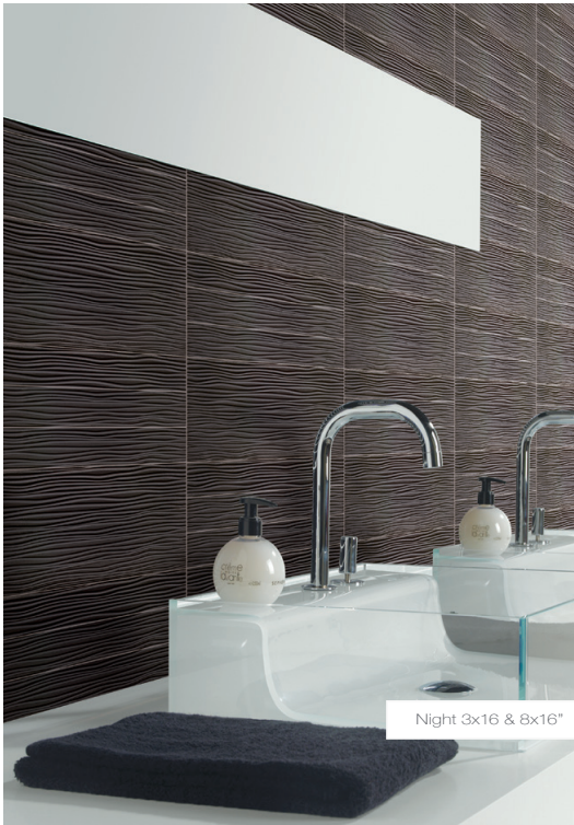
Night 3x16 & 8x16"