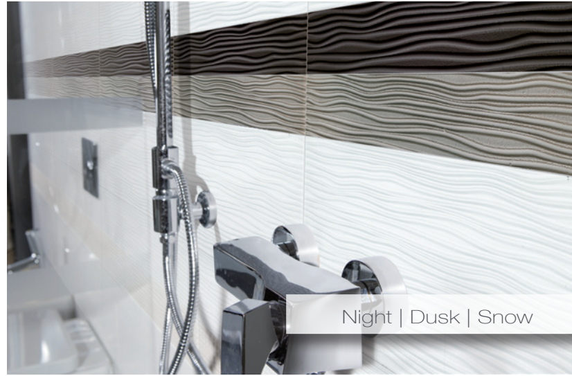
Night | Dusk | Snow