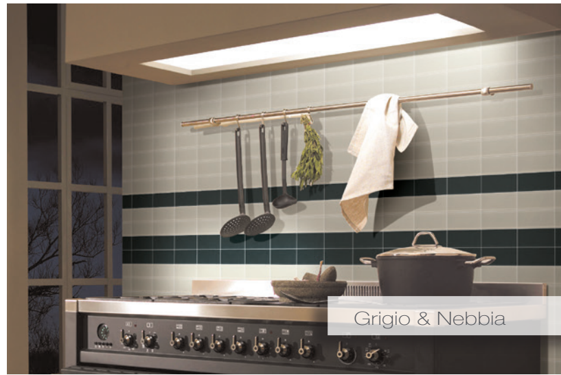
Grigio & Nebbia