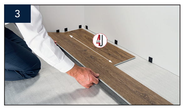
Figure 3: Use a full length for Plank 2 which will be installed in the second row. Align plank 2 at an angle, onto the long side of plank 1 making sure there are no gaps. Drop plank 2 to lock in place.