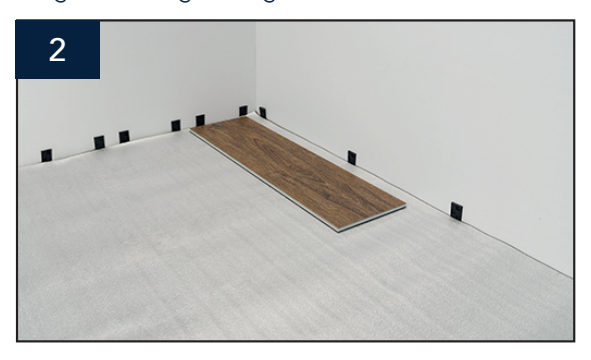
Figure 2: Begin by cutting plank 1 in half. Position the cut end of plank 1 against the wall in the left corner of the room.

It is very important that the first two rows are installed properly. Installation will alternate back and forth between rows one and two, for the first two rows only. The first row of planks will be placed with the grooved edge facing outward into the room.