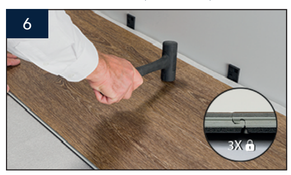
Figure 6: Using a rubber mallet, lightly tap the joint on the short side to engage the locking system.