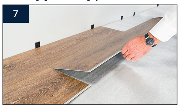
Figure 7: Continue alternating planks on rows 1 and 2. Insure planks are properly aligned along the chalk line and against the spacers. Finish rows 1 and 2 in this manner, cutting planks at the end of the row as necessary. Insure that the end planks are a minimum of 6" in length. If necessary, adjust the length of starter pieces to insure minimum plank lengths for each row, with proper end joint stagger row to row.

Installation of all additional rows will start by angling a plank on the long side, and sliding plank to the left until the short sides are in contact. Lock the short side as instructed for rows 1 and 2 using a rubber mallet to engage locking system as shown in Figure 5.