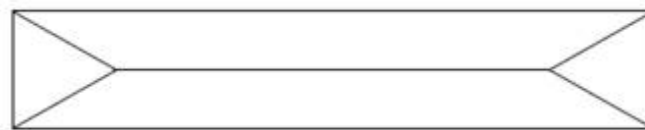
SCORE TILE AS SHOWN

1. Score top of damaged plank/tile with a utility knife. Make two triangle cuts near the end joint and then connect the points with one long cut in the middle of the plank/tile. (See diagram below.)