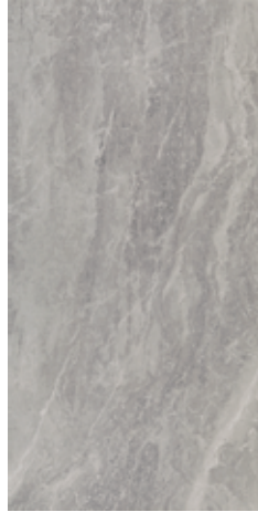
Gray | V3

48x48 NAT RECT | POL RECT 24x48 NAT RECT * | POL RECT * 12x24 NAT RECT * | POL RECT *