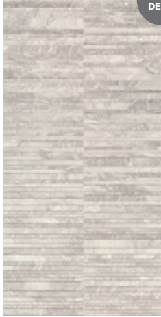
White Ply | V3

Single Bullnose 3x12 NAT RECT * | POL RECT *