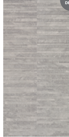
Gray Ply | V3

Single Bullnose 3x12 NAT RECT * | POL RECT *