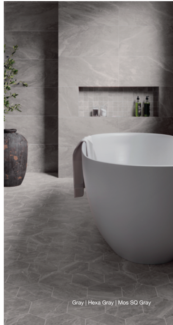
Gray | Hexa Gray | Mos SQ Gray