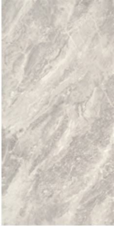
White | V3

48x48 NAT RECT | POL RECT 24x48 NAT RECT * | POL RECT * 12x24 NAT RECT * | POL RECT *